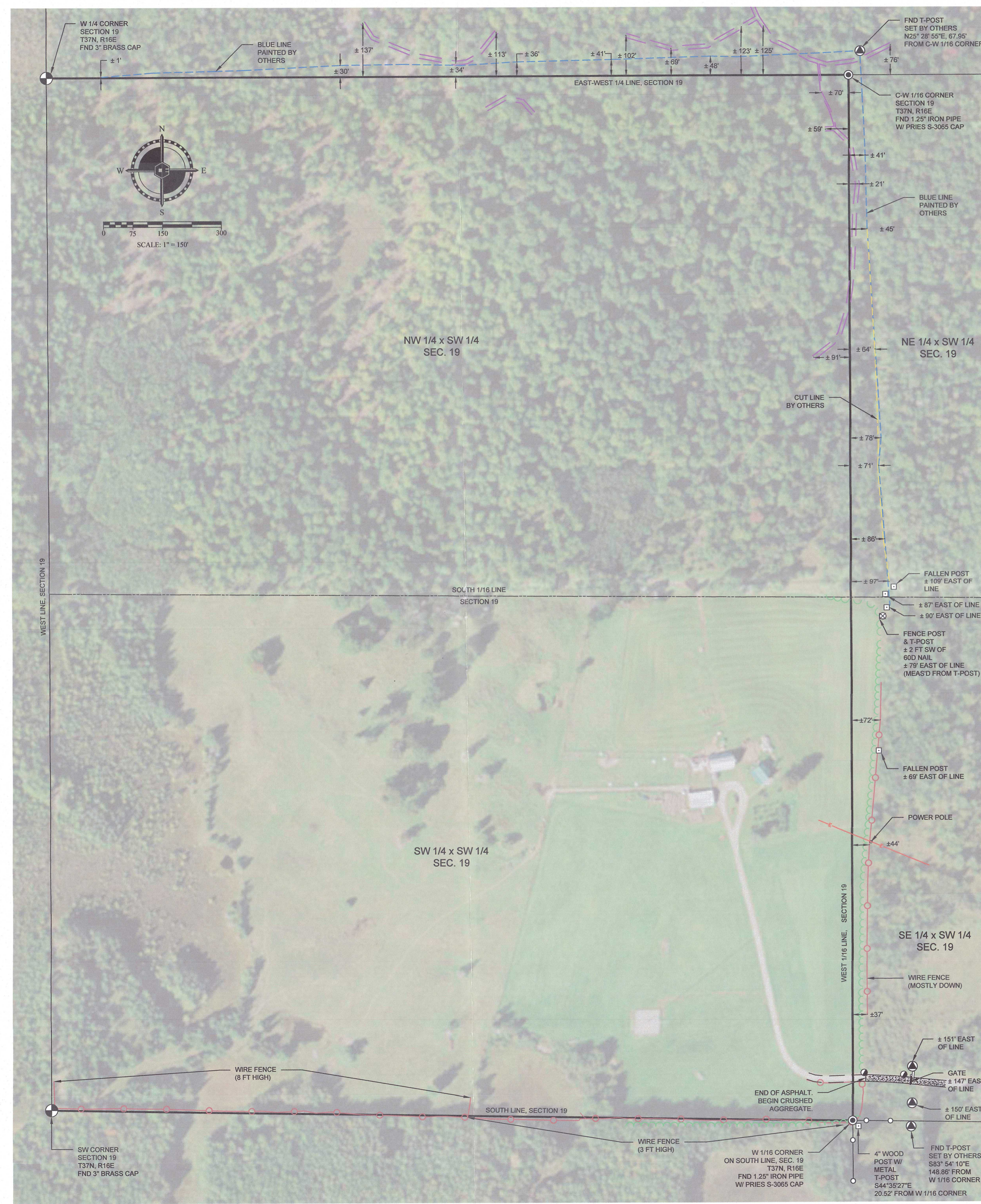
DETAIL 1: 1 IN = 150 FT

CLIENT: SURVEYED BY: CEC DRAWN BY: MAT CHECKED BY: JDB DATE: 11/15/16 CAD DRAWING: 16011-L-PLAT 24036.DWG CAD PROJECT: 16011-A DRAWING NO. 1